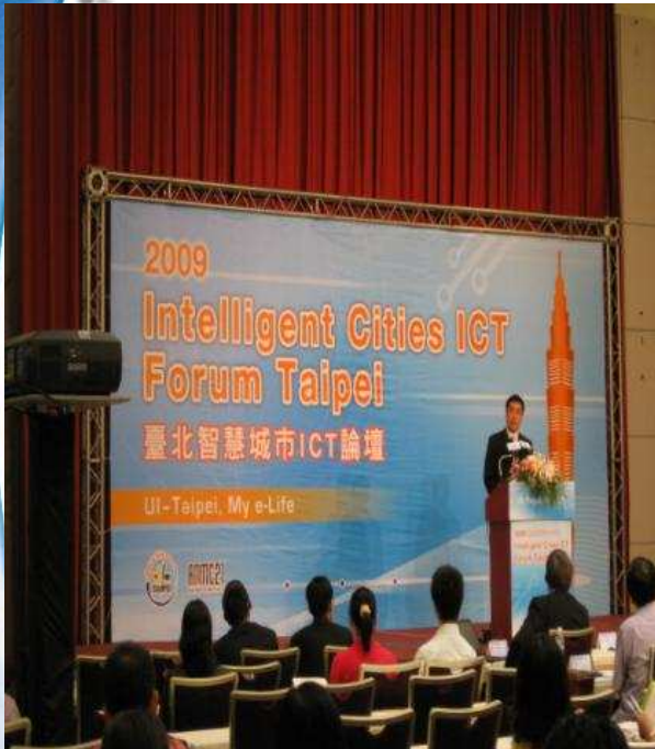
Open Ceremony: The Mayor of Taipei Dr. Hau Lung-bin