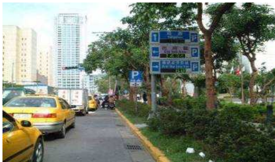
e-Parking Reduce waiting time