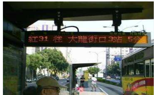
e-Bus Encourage more people to take bus