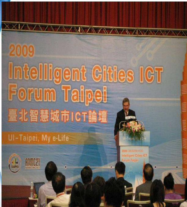
The Deputy Mayor , Vilnius City, Lithuanian Mr. Gintautas Babravičius